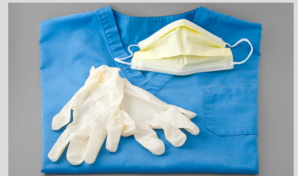
▼ MASKS AND GLOVES