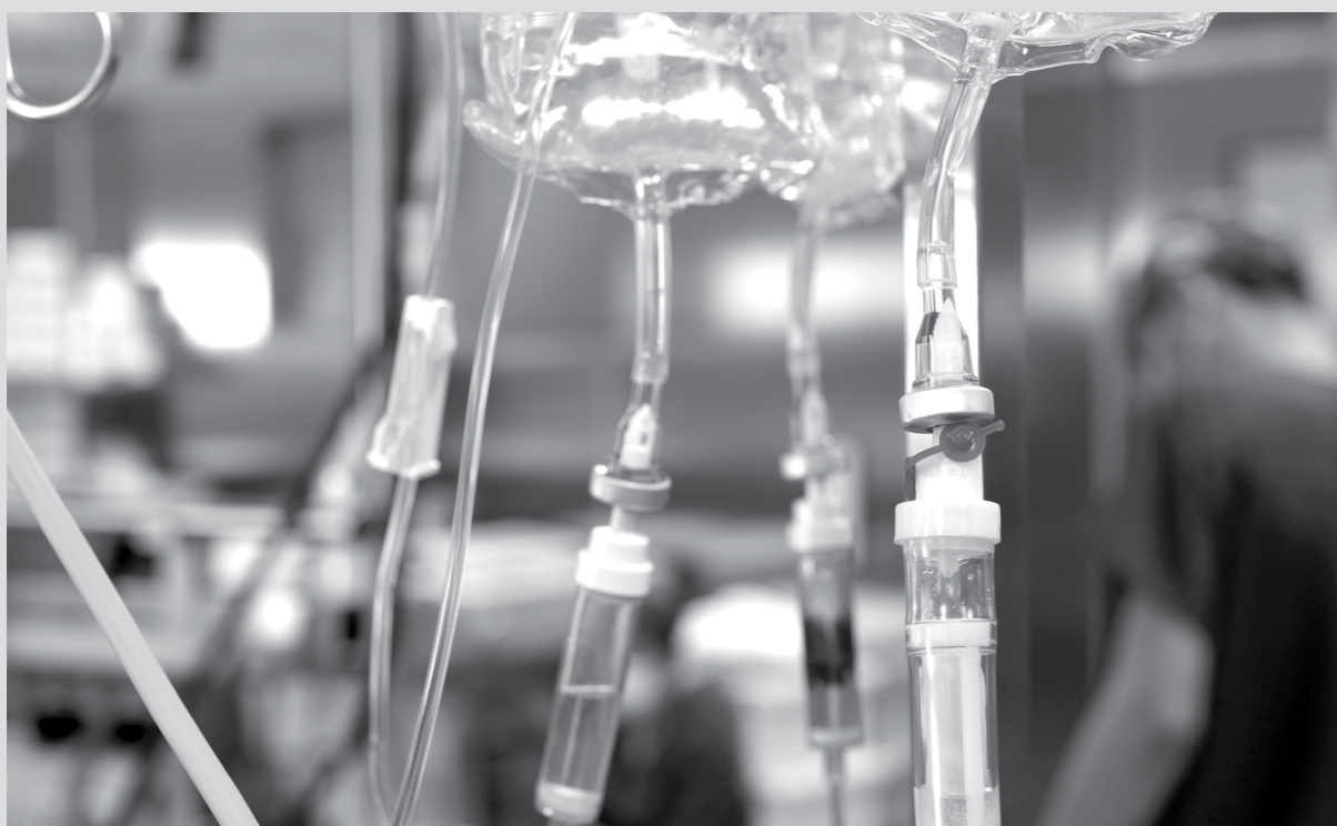
▼ TUBING AND EMPTY BAGS

Trace chemotherapy waste is waste that is contaminated through contact with chemotherapeutic agents