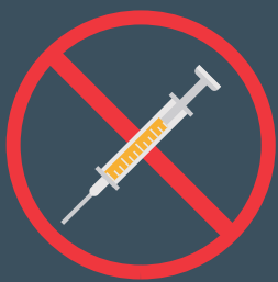
Sharps or IV Bags with Residual Meds